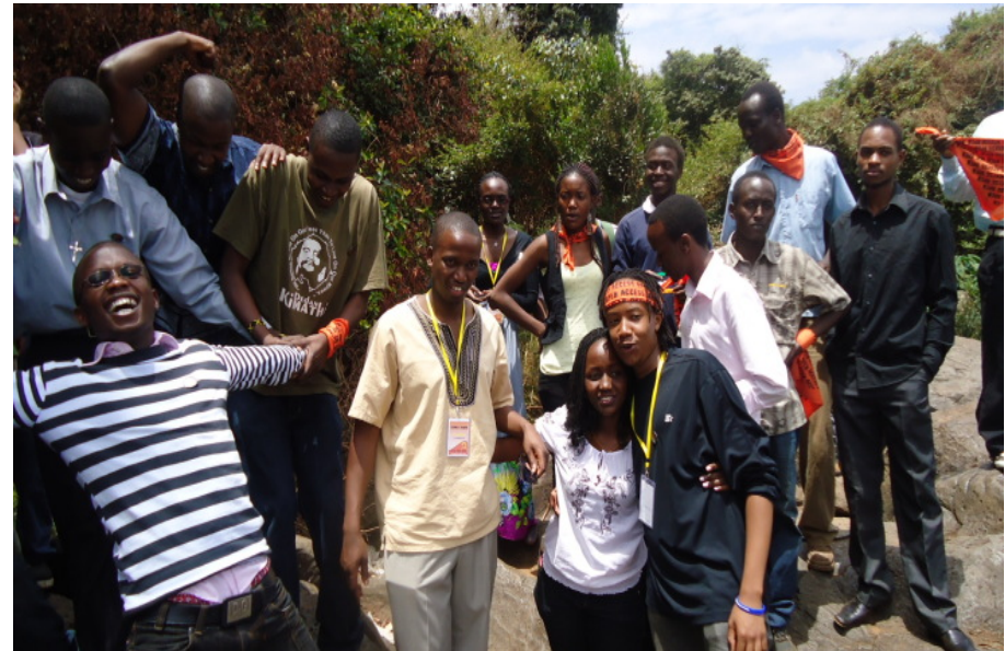
Jomo Kenyatta University Fashion Show