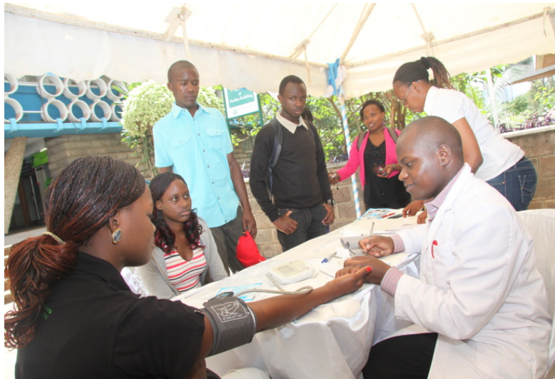
Free Medical Screening, 2012