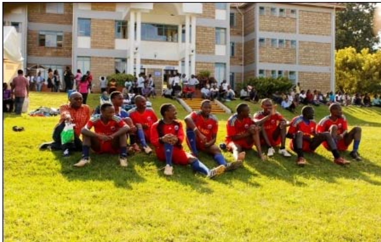
Methodist University Students