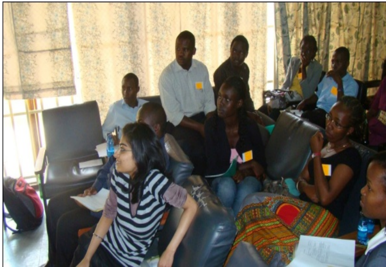
Joint OA Training