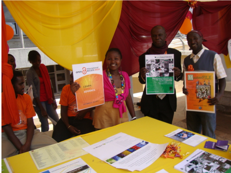
Catholic University Students