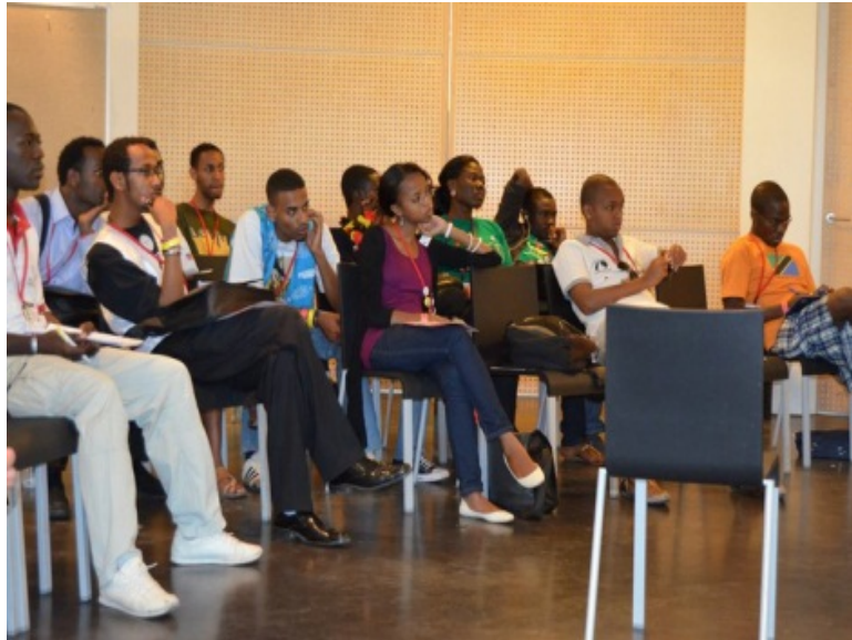
IFMSA Meeting, August 2011