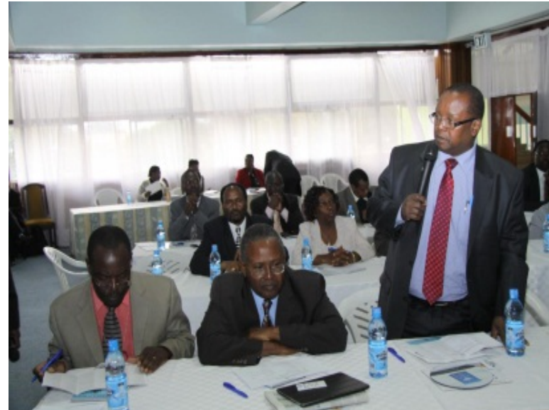
OA/IR Workshop, Aug 2012