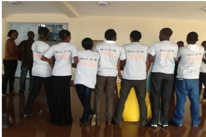
Kenyatta University Chapter