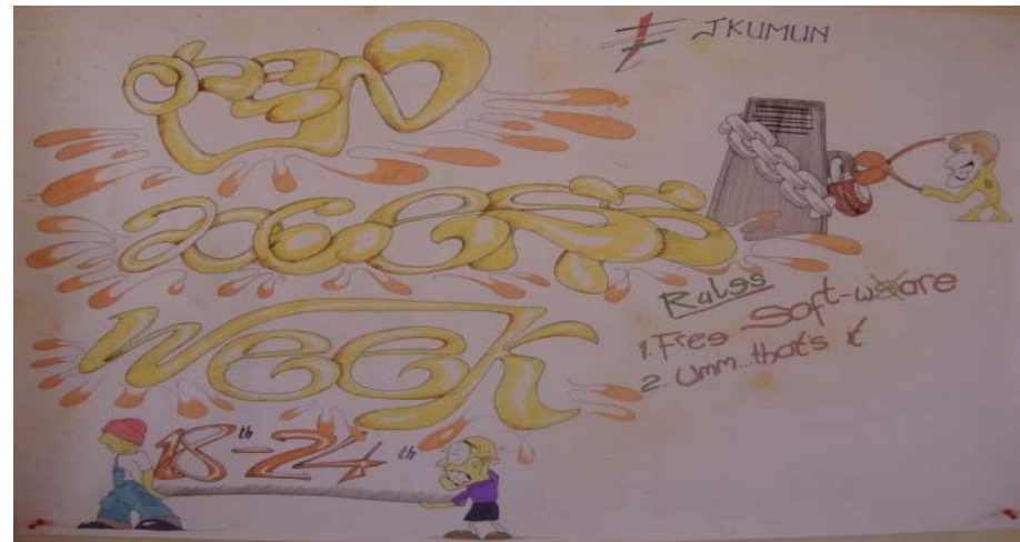
Jomo Kenyatta University Artwork