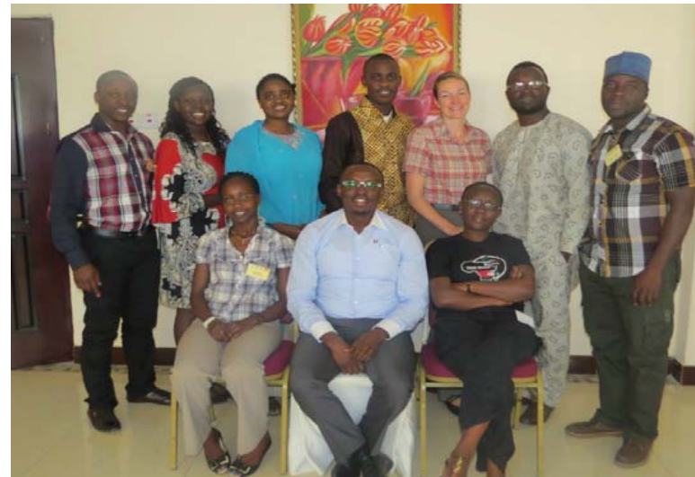
IPPNW Meeting, October, 2013