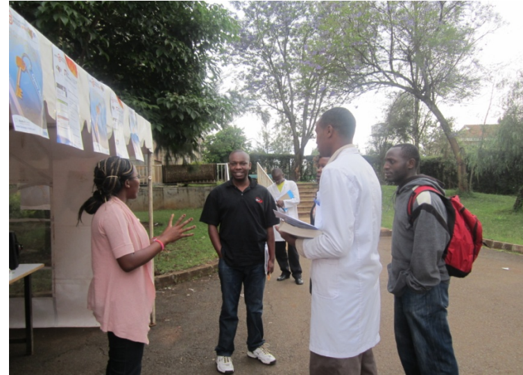
Moi University Chapter