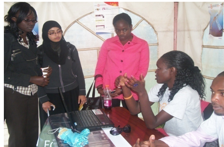
Egerton University Chapter